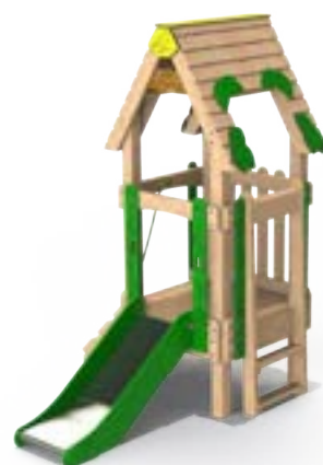
Large Deck Width